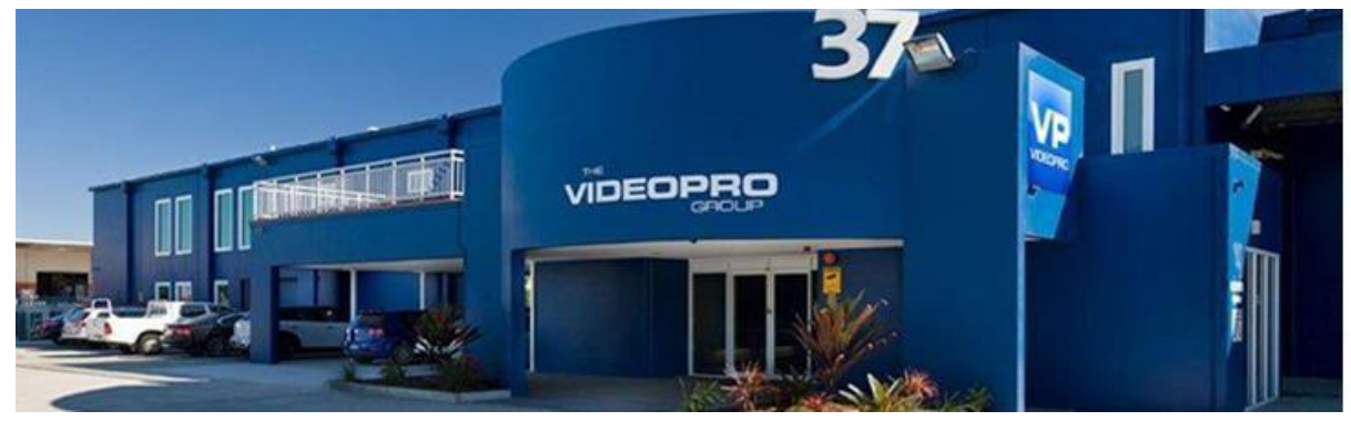
Head Office and Logistics Hub

Since its inception in 1980, VIDEOPRO has grown to be one of Australia's leading technology companies. With world-class industry expertise, VIDEOPRO are your providers of Audio, Visual, Computers and Solution products.